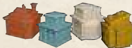
12 House pieces (28 of each color)