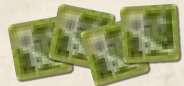
20 Park tokens