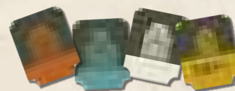
4 Scoring markers (1 of each color)