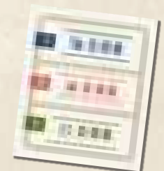
1 Reference tile