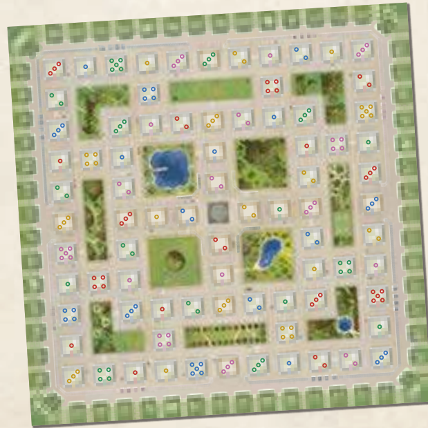
1 game board

Even behind the appearance of the most serene and romantic residential neighborhood lies fierce competition between construction companies to build it! Grab the most prestigious plots of land and build beautiful houses, but don't forget the requirements of the town plan to accumulate bonus points and claim victory!